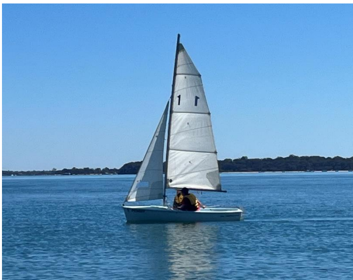
Sailors at ease