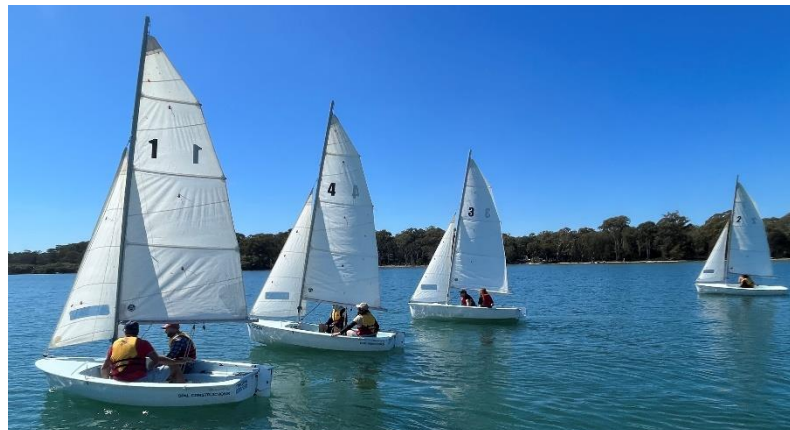
Start of 3 rd race – very close