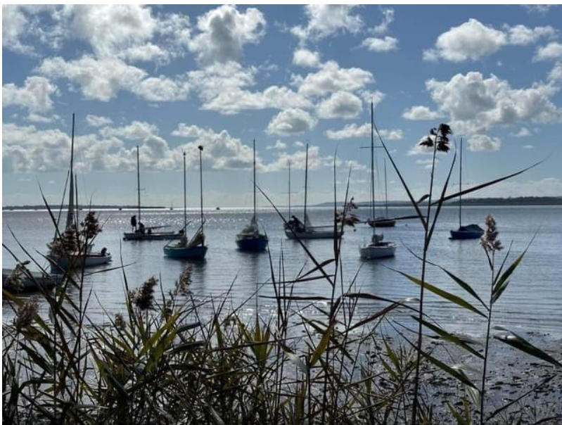
The fleet awaits the tide at Pt Talburpin