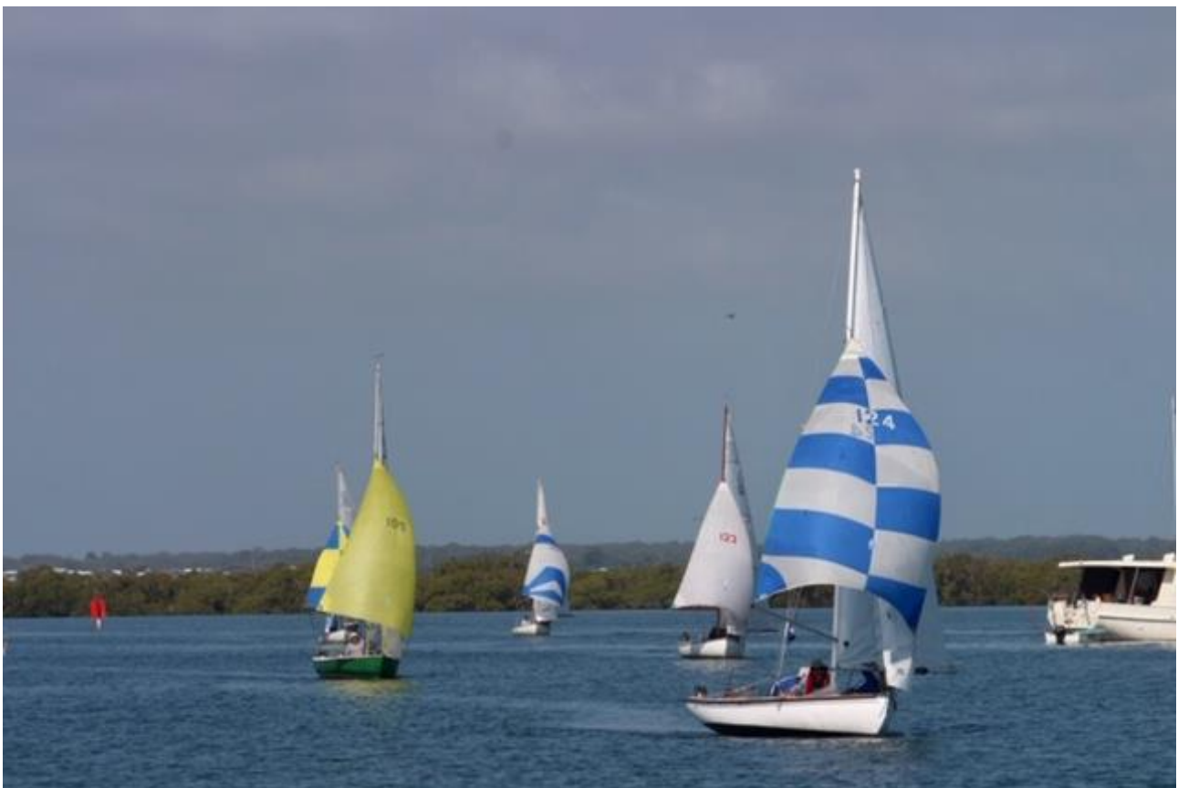
Spinnakers added colour to what was already a beautiful day on the water

The first two of the three races were sailed in a light southerly breeze. Skippers and crews had to adopt light weather sailing techniques to get the most from their yachts. The first two races saw some close and competitive sailing. The light conditions provided a good opportunity to practise spinnaker hoisting and setting. The colourful spinnakers of the six Jubilees added colour to what was already a beautiful day out on the water.