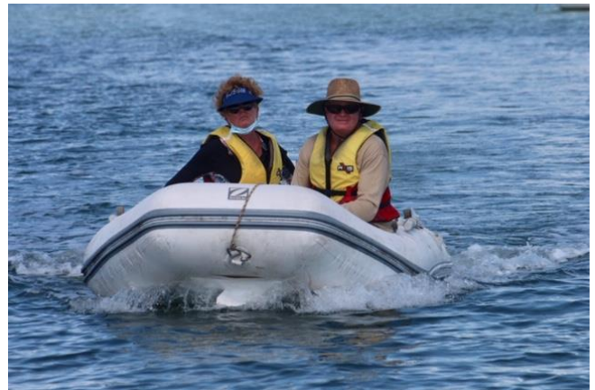
Tingira's two safety boats 'Sandpiper' (Moss and Bob) and 'Tango' (Glenys and Max)