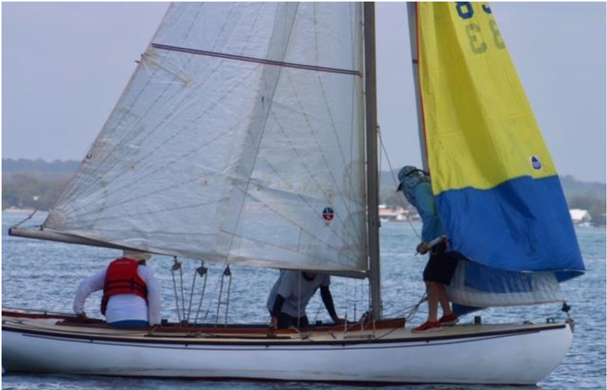
A good opportunity to practise spinnaker hoisting and setting

The third race was shortened as the breeze was fading and time (due to the tide) was running short.