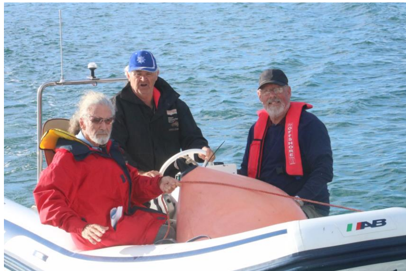
Retrieval from Silver Moon