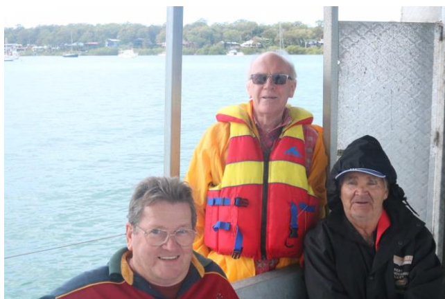
Support Crew on the Pontoon