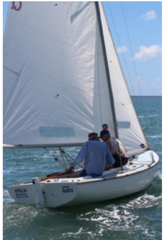
Stella sailing in home waters off Macleay Island.

3 Million Cheers for our Tingira Sailors!