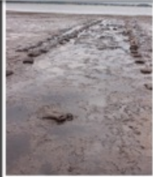
Tingira Boat Club Health Spa?